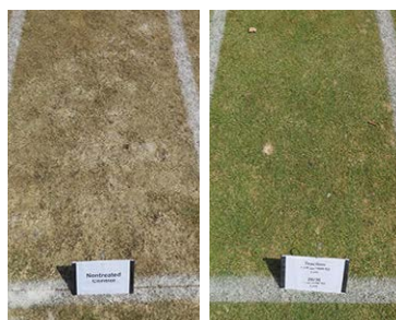
Nontreated Control Tracti o n™ + 26/36®